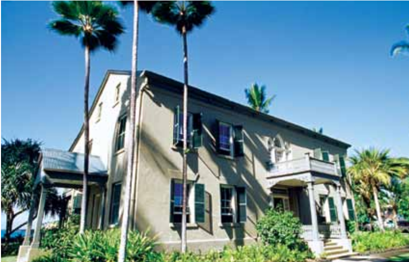
Kirit, Lee Aaeleer

The Kona (West) Side of the Island is known for its sparkling resorts, world-class golf courses, white sand beaches and homegrown Kona coffee! These coastal waters offer thrilling big-game sport fishing and jewel-box snorkeling, while the landscape, carved into an ancient lava flow, records the past in its sacred heiau (temples) and historic sites.